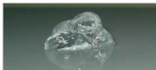
Monophasic HA 24mg/g

Redensity [II] Eyes has been developed thanks to an innovative production process resulting in a subtle balance between a 15mg/g concentration level of hyaluronic acid and a semi-crosslinking process (a combination of cross-linked* and non-crosslinked hyaluronic acid). This characteristic implies controlled risk of swelling with very low risk of oedema (2) .