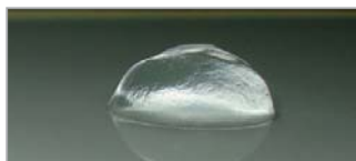
Biphasic HA 20mg/g

➔ A low hygroscopic activity : 15mg/g hyaluronic acid concentration level combined with a crosslinked process (a combination of crosslinked and non-crosslinked hyaluronic acid) produces a low-hygroscopic gel. This characteristic allows controlling the risk of swelling with very low risk of oedema (2) . The effect of the injection is immediately visible and enduring over time.